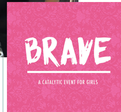
BRAVE curriculum and campaign focused on empowering foster girls