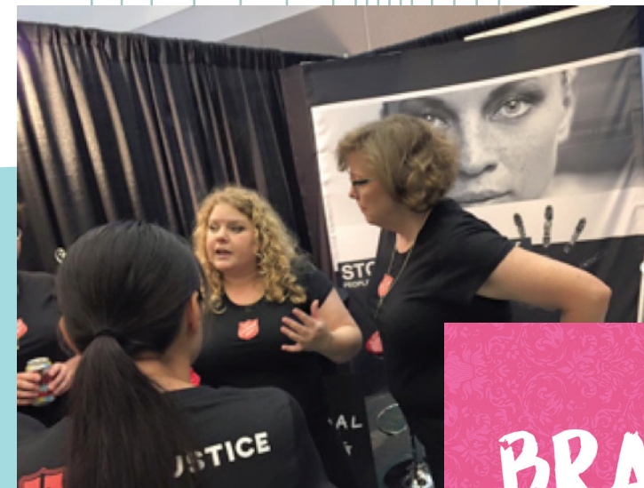
Outreach to the sex industry