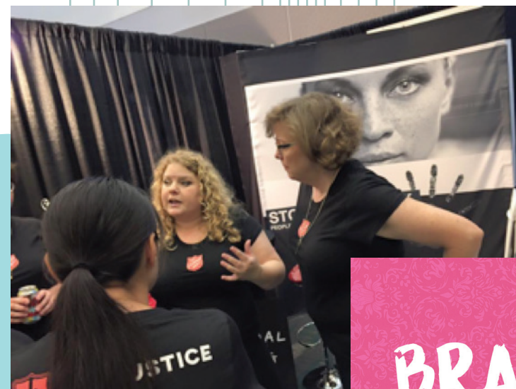
Outreach to the sex industry