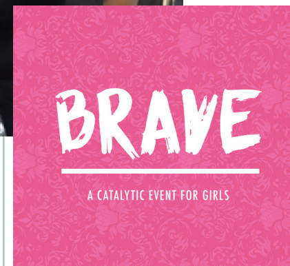
BRAVE curriculum and campaign focused on empowering foster girls